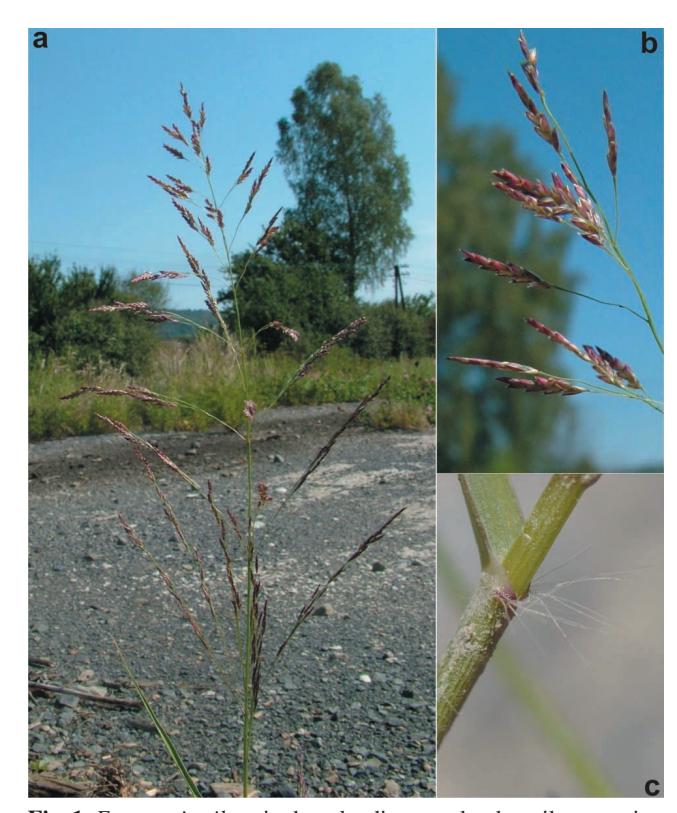
Fig. 1. Eragrostis pilosa in the reloading area by the railway station at Nowosielce

Until 2005, Eragrostis pilosa had been recognized as a holoagriophyte, spreading mainly on sandy alluvia in the Middle and Lower Vistula as well as the Lower San Valleys (Ceynowa-Giełdon 1973; Sudnik-Wójcikowska & Guzik 1996; Kucharczyk 2001). The plant was also reported on anthropogenic sites in Warsaw (Sudnik-Wójcikowska 1981; Sudnik-Wójcikowska & Guzik 1996), Szczecin (Holzfuss 1937; Ćwikliński 1970), Piła (Żukowski 1960), Dęblin (Głowacki 1975) and in the area of the Lubelskie province (Święs & Wrzesień 2002, 2003, 2004). Unfortunately, almost all these data were incorrect and the specimens collected in the territory of Poland, previously identified as E. pilosa, in fact belonged to E. albensis – the species described as new to science by Scholz (1996). What is more, in recent years, an intensive spreading of E. albensis in Poland has been observed (Michalewska & Nobis 2005; Guzik & Sudnik-Wójcikowska 2005; Wrzesień 2005, 2007;